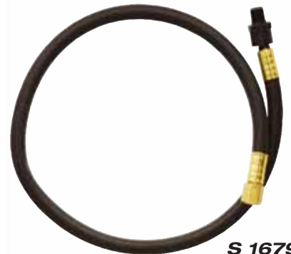
S 1679 S 1679-2