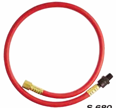
S 680 S 680-1 S 680-2 S 680-3 681 681-1